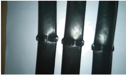
Welded joints photo